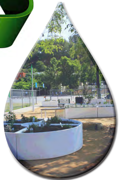
Kennedy ES SEEDS Learning Garden