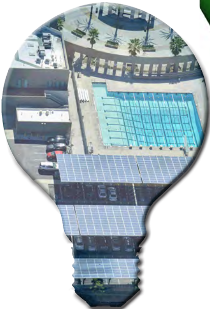
Maywood Academy HS Photovoltaic Installation