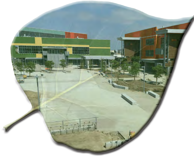
South Region HS #8 Opening Fall 2017